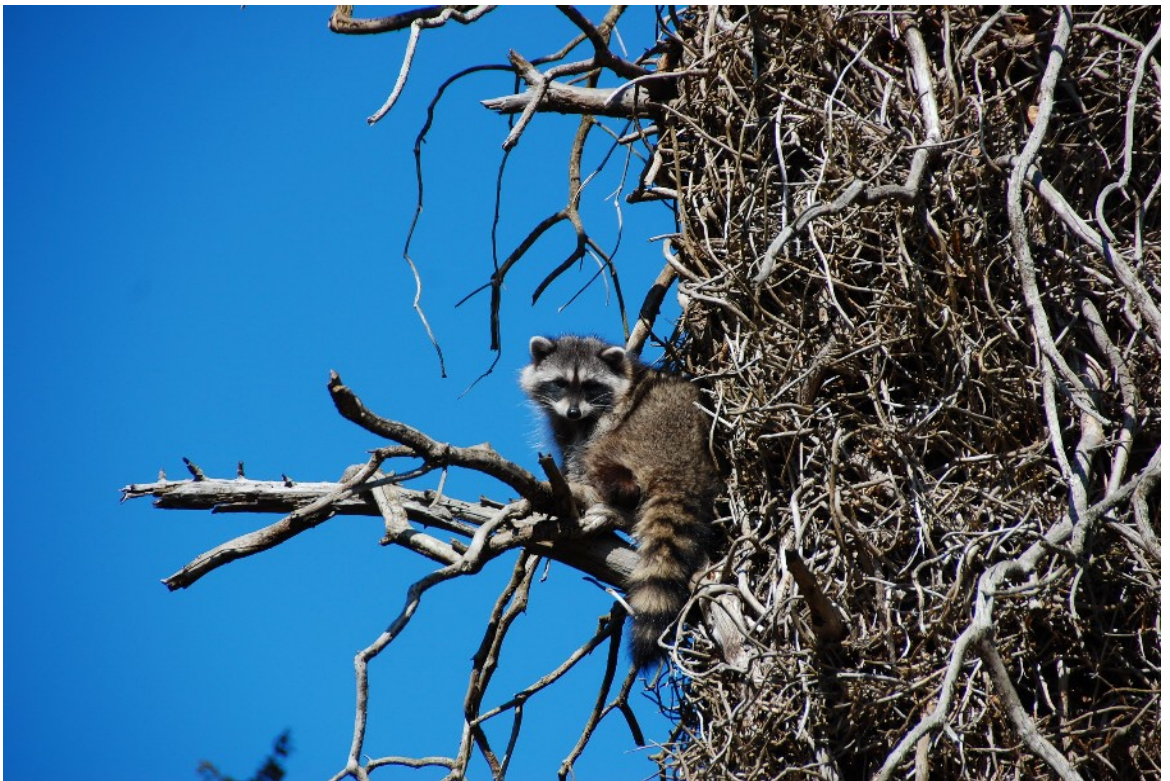
One of the many friends of Mount Douglas Park!