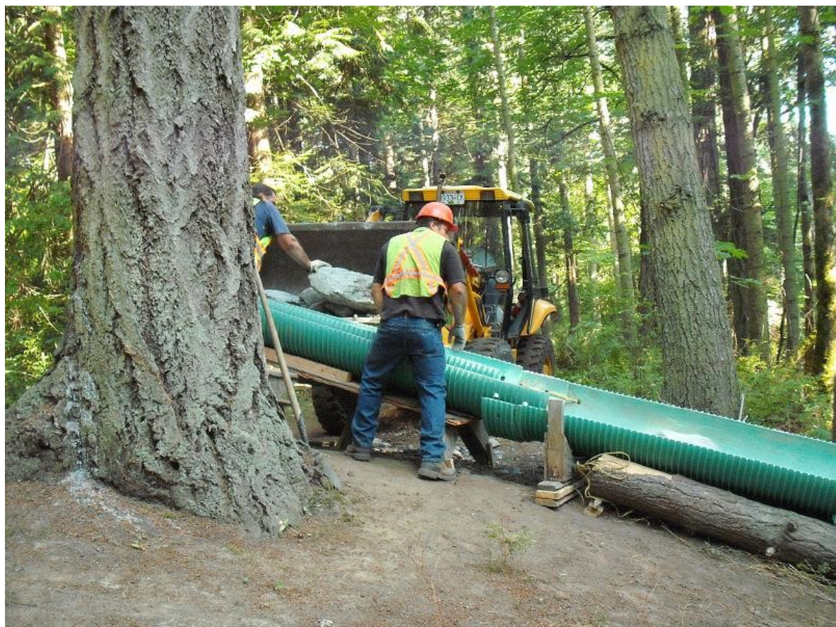
Saanich crews slide large rocks down chute to build spawning pools and riffles.

spawning gravel, as well as five long Douglas fir stems. It was a major problem, but the people who work for Parks sorted it out like the true professionals they are. As it turned out the boulders were almost too big to fit into the chute system used to deliver material into the Creek. Huge piles of boulders had to be handled one at a time to get them into the chute. But they did it at two drop sites, and they had it all in before the next stage of the project. That was very well done!