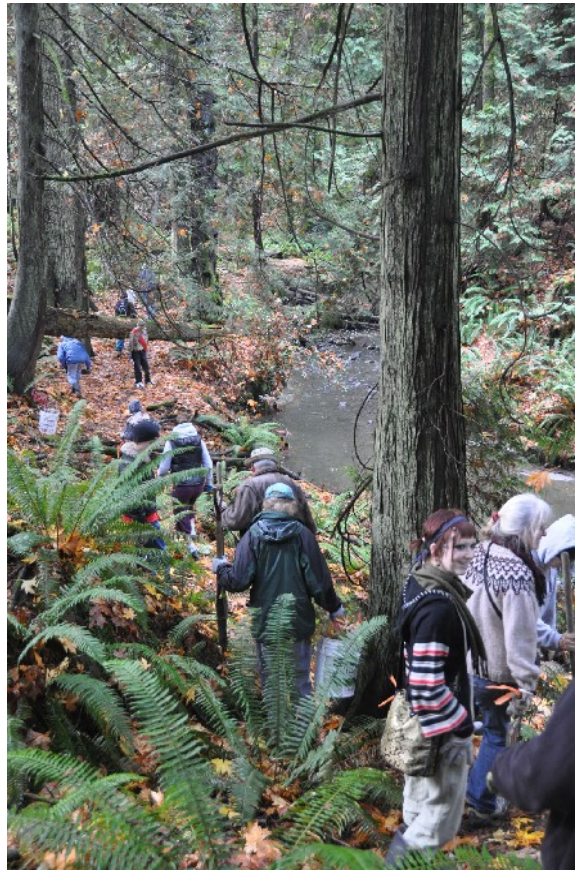
Volunteers walk down to the creek to begin planting the plugs

. . . we hope to put another salmon carcass transplant together sometime before Christmas. We have talked about the importance of marine-derived nutrients as a prerequisite for healthy ecosystems in the Pacific Northwest. Planted at the top end of the Creek, those nutrients are made available to vegetation and invertebrates over the length of the Creek.