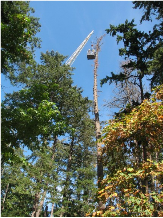
Saanich crews fly high to top dead tree at new Churchill parking area.