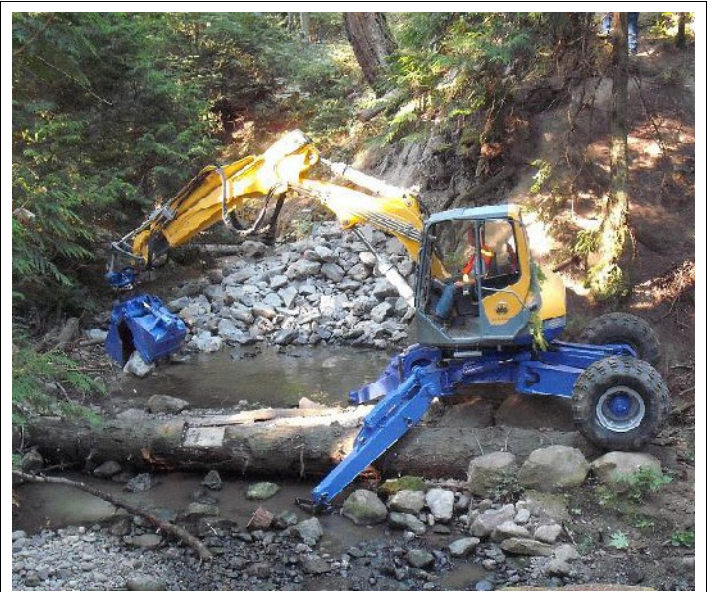
Spyder hoe places rocks to build spawning pool.

Three-and-a-half days and Len was done. He ran us out of material building riffles amongst the woody debris. He also walked the machine down the Creek and built a Finnegan's Rake woody debris structure to protect a badly eroding stream bank; while down there he repaired a woody debris structure which was creating a good pool with a downstream tail out, frequently used as spawning habitat by chum. Len is a special person: we need to see a lot more of him for the next five or so years.