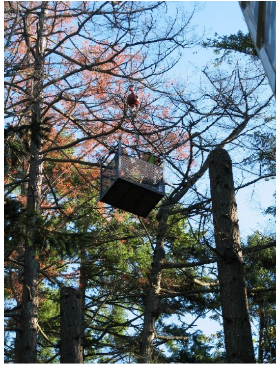
Danger trees were topped and left as wild life trees.

Our surveys have shown that the majority of morning walkers up Churchill Drive come from outside the Gordon Head area, which no doubt explains the number of cars attempting to park in the lower lot, often exceeding its capacity. In conjunction with the new gate hours, the lower Churchill Drive parking area is being redesigned and expanded. The gate has been moved a little further up the road. A new concrete curbed turn-around area has been created near the gate. By the time you read this, there should be a new information kiosk with maps and other Park information, a large semi-underground waste bin, and bicycle racks, all near the gate. This new parking area is a significant improvement over the old, which was in a poor condition. Although it provides an expanded number of parking stalls, there are still more cars arriving than it will accommodate. We need either to find ways to get people to the Park without a car and/or find new ways to accommodate these cars.