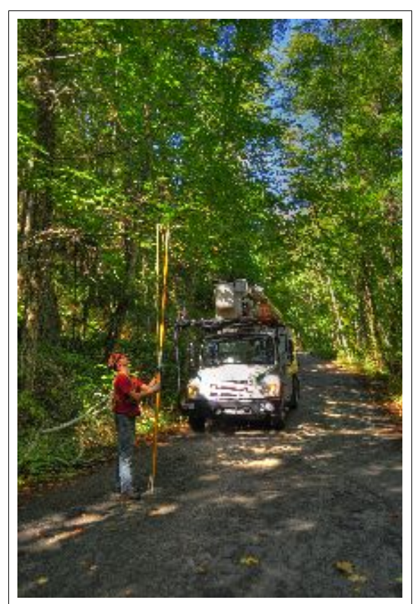
Saanich Parks crew measuring clearance before trimming low branches

During September Saanich Parks cleared overhanging tree branches along Churchill Drive in Mount Douglas Park as well as roads in Gordon Head and Cadboro Bay. This was initiated by the Saanich Fire Department's new truck that is now stationed near the University of Victoria. The trimming was done to the prescribed legal passage height of 14.5 feet. The Parks crews used a measured stick to determine what needed trimming as they worked their way along Churchill Drive and only cut branches hanging below the legal height that might catch on the fire truck, possibly dislodging a ladder or other equipment.