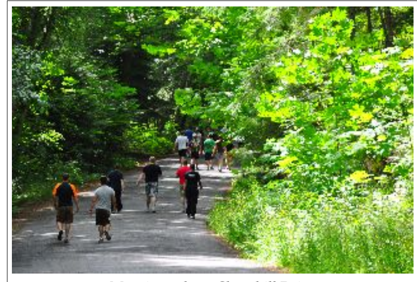
Mornings along Churchill Drive

Many have noticed the very significant increase in walkers, young and old, families with baby strollers walking up Churchill Drive in the morning enjoying the nocars, no-exhaust, no-noise until noon. Perhaps one of the most telling comments often heard is "we have to get back down before the gate opens!" The idea of the new hours was to