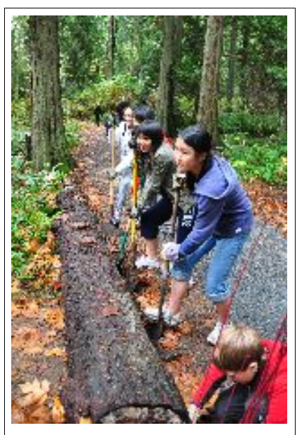
A volunteer line up!

almost 2000 trees and native plants grown by Rob Hagel at Pacific Forestry Research from Centre seeds harvested in Mount Douglas Park. Planters were in two locations, in the area of the Irvine Trail and Churchill Drive and along Douglas Creek near the new Salmon Life Cycle interpretive sign. spotted several Councillors helping with the planting - Judy