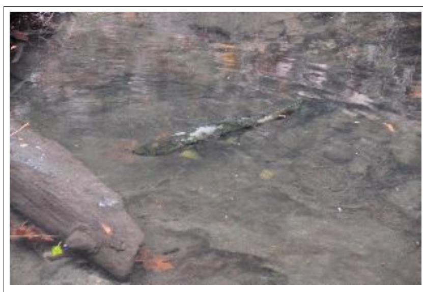
A large female Chum Salmon near Ash Road!

Hold the presses! Just as the newsletter was to be printed, salmon were spotted in Douglas Creek. A large female Chum salmon was spotted in one of the restored spawning pools near Ash Road. This means she successfully