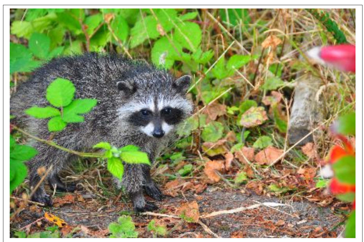
Another friend of Mount Douglas Park

Please remind friends and neighbours to take their yard waste to their local municipal yard for proper treatment and that dumping anything in our parks is not only illegal, it's an additional and unnecessary cost to tax payers and seriously endangers the health of our parks.