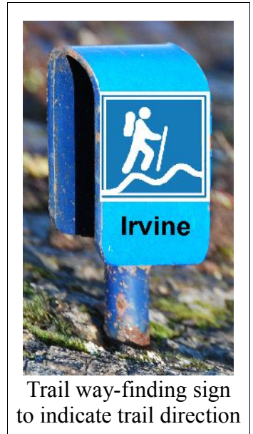
Trail way-finding sign to indicate trail direction

We are very pleased to report that Parks will install a complete sign system on the Irvine Trail this spring. We recommend the Irvine Trail, because it goes all the way from the beach area to the summit and includes all three trail categories.