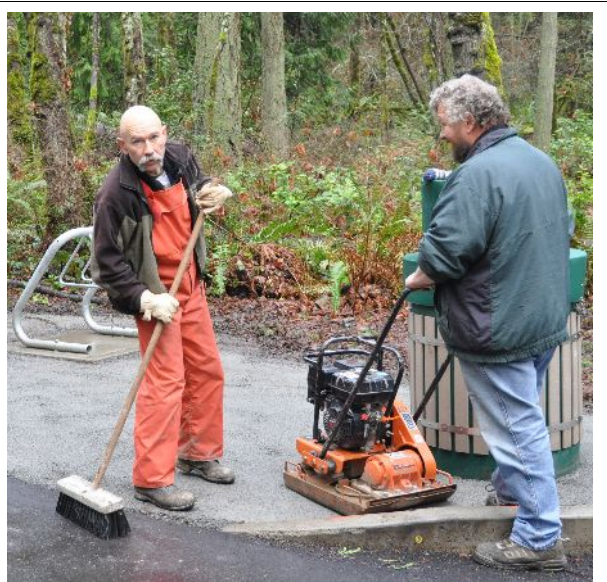
Saanich crews put the finishing touches on the new parking lot area. A job well done!

We reported in the last newsletter about the redesign of the Churchill Drive parking lot in conjunction with the new gate closure hours. The majority of the work was done in late spring and it is a clear improvement. As was reported, part of the plans for the new design was a new information kiosk with maps and other Park information, a large semi-underground waste bin, and bicycle racks, all near the gate. It was a surprise to us when a large warning sign took the place of the promised information kiosk. We have told Saanich Parks that this is a mistake that needs to be corrected. A bicycle rack did appear, but with only half the capacity of the summit rack, it is far too undersized. We have already seen it full (it might hold three bicycles comfortably) and summer isn't here yet. It needs to be replaced with a proper-sized rack. When the new hours were approved at the Council meeting, it was stated that Parks would work with our Society concerning new signs. Because parking is banned along Churchill and the space for parking at the summit is limited, drivers should be encouraged to park below and walk up. Walker, service vehicle, and automobile safety issues should also be addressed. So far no progress here. And