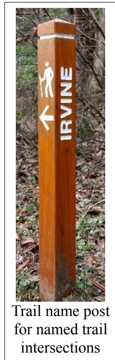
Trail name post for named trail intersections

It is our hope that with proper trail signage and improvement of trail conditions, the number of impromptu and shortcut trails will diminish and these areas can be restored.