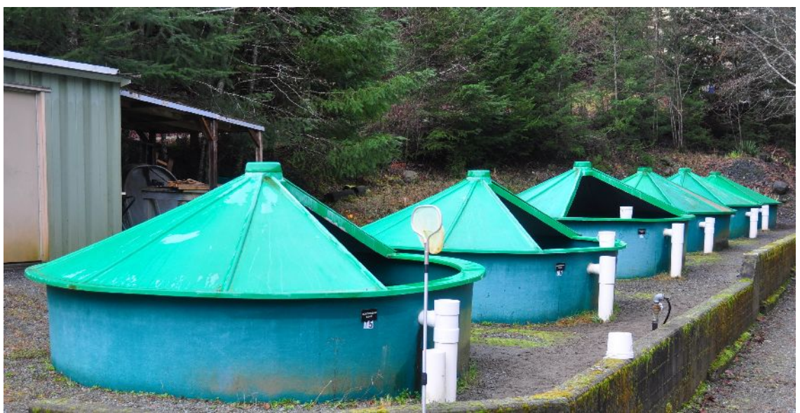
A few of the hatchery tanks that can each hold 10,000 salmon pre-smolts or “parr”.

The Goldstream Volunteer Salmonid Enhancement Association has extended an invitation to members of the Friends of Mount Douglas Park Society for a tour of the Howard English Hatchery. The hatchery is located within the controlled area of the CRD watershed, so access is by invitation only. Full access details are not available at press time, so watch our website for updates. Because of the access security, arrival times might be restricted.