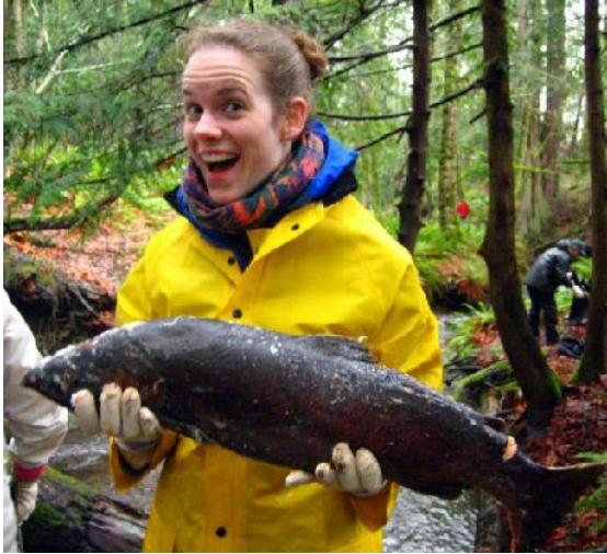
I love salmon

aquatic habitat. A tremendous amount of work has been done by the Howard English volunteers. They help our program to stop the extinction of salmon populations on this coast. Thankfully there are people like these in the world; it would be a barren place without them.