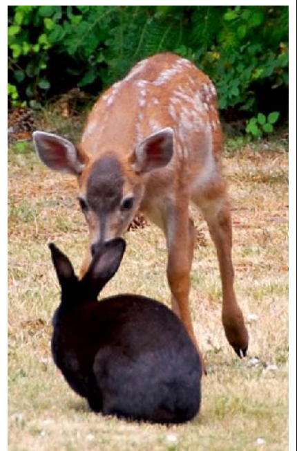
Two Mount Douglas Park residents. The non-native rabbits are a problem. The Park's birds of prey do catch some so don't abandon your Easter bunnies here!

There are two fundamental problems facing Douglas Creek, both relating to the Gordon Head watershed. The first is water volumes, surges during storms and low water in summer. The second is water-borne pollutants. They are not independent problems and some solutions can address both.