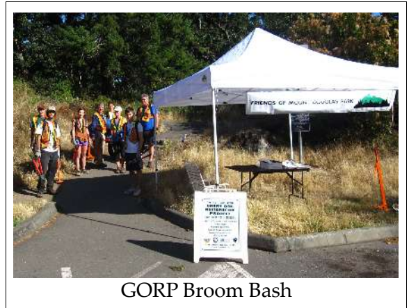
GORP Broom Bash