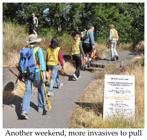
Another weekend, more invasives to pull

The work of the invasive species group is another Park success story; there is real progress to report. Many park visitors, as they walk up the lower parts of Churchill enjoying the rejuvenating native plants along the road, have no idea what the invasive infestation looked like not too long ago. Along Churchill, and in many other areas of the Park that have been successfully cleared, the work will always continue, but it has changed from an invasive-dominated landscape to natural plants with only a few invasives attempting a come back.