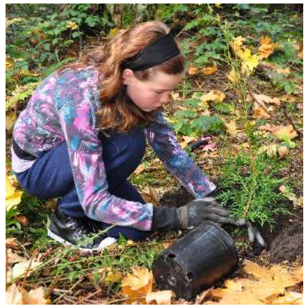
Small now, but carefully planted and it will grow to protect the creek bank and provide shade.

Tree Appreciation Day 2011 is only a one-day event – that is for the volunteer planters. But the preparation starts a year in advance with lots of very appreciated help: