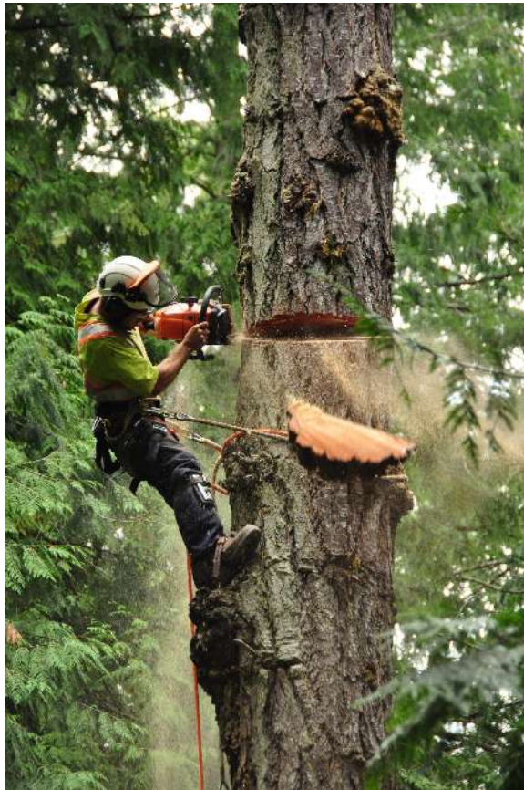
This was the only tree identified as a danger tree; it was topped to remove the danger and left as a wild-life tree.