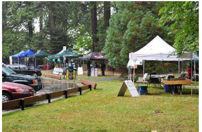
Rivers Day in Mount Douglas Park

We are very pleased with the results of the campaign and we hope that the community will continue to appreciate and learn about the watershed they live in. Good luck to the Friends of Mount Douglas Park as they carry on with restoring and promoting Mount Douglas creek.