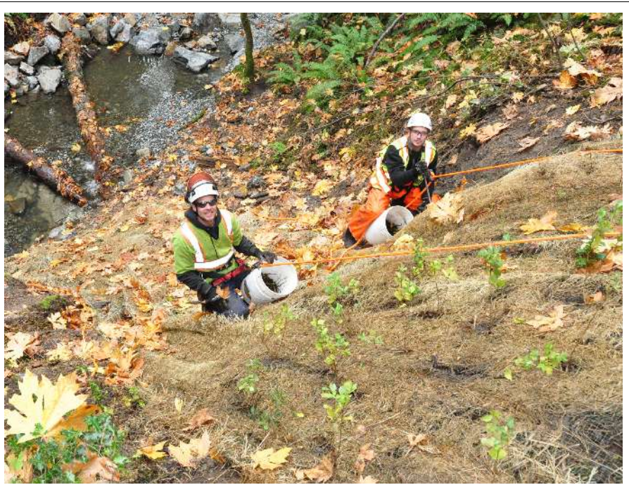
Saanich crews used ropes to plant the steeper creek slopes.

Surveying the results, this year's event was the most successful yet, and credit goes to Saanich Parks for the superb organization. We had more volunteers and the actual planting showed the better organization. Early that morning, Parks employees carefully placed the plants where they were to be planted so that the volunteers "only"