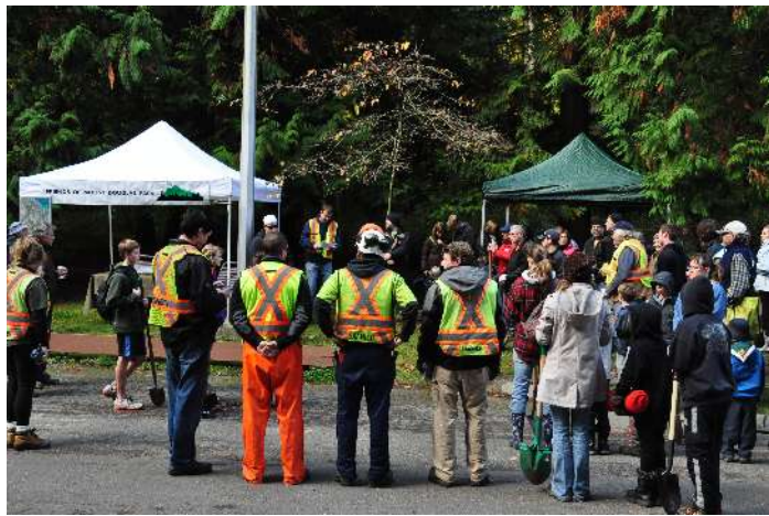
Over 100 volunteers planted more than 2200 trees and shrubs.