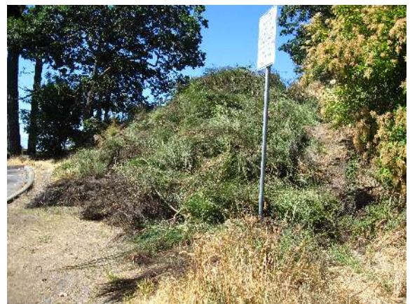
Another pile of invasive plants successfully removed from the Park.

There is a group pulling invasive plants at least one weekday each week with several weekend events during the year. See the calendar of events on our web site for specific dates.