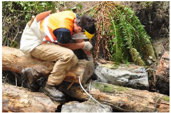
Logs are used to protect the banks and to provide salmon habitat. Because of the large storm surges, each log must be anchored to heavy rocks with cables.