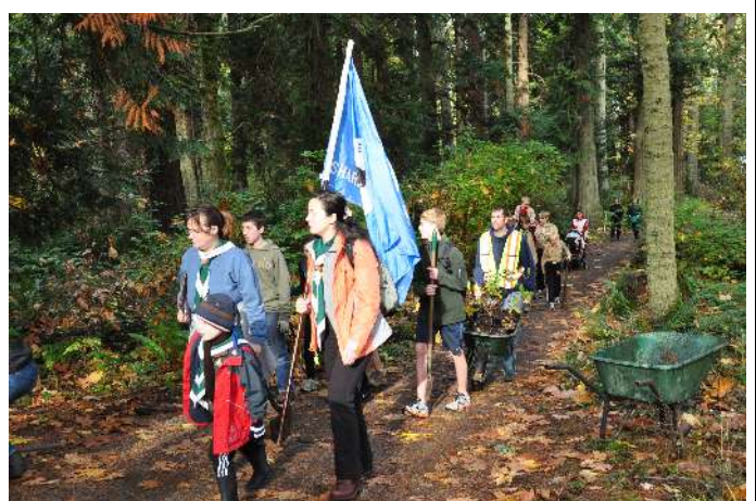
Lead us to the trees!