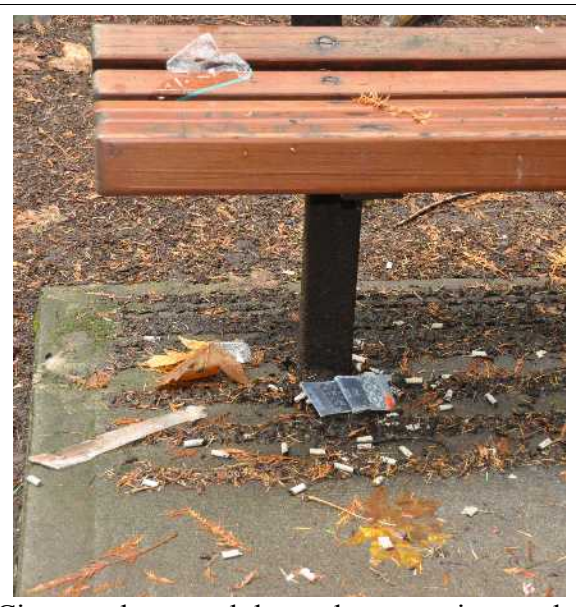
Cigarette butts and doggy bags continue to be the most frequent park litter. What happened to the expression "take nothing but memories, leave nothing but footprints"? And we need to add that the footprints left behind should be on recognized trails!