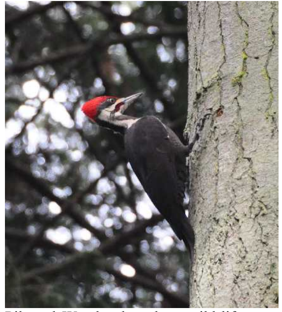
Pileated Woodpeckers love wild-life trees and are easy to spot along the lower trails.

Saanich Parks utilizes tall trash receptacles that are installed with the lower five to six feet underground. This provides considerable hidden capacity while requiring less frequent emptying. One is installed at the bottom of Churchill Drive near the gate, another is installed by the washrooms in the beach parking area.