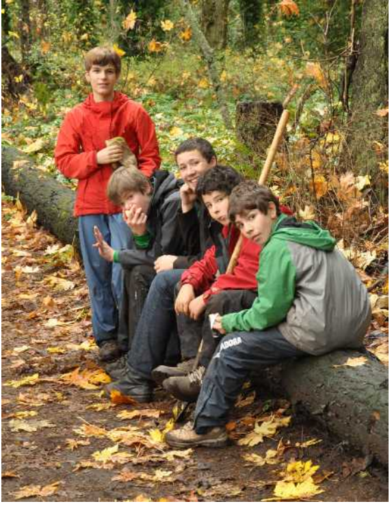
A little R&R after a morning of hard work!