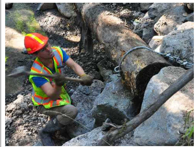
Cabling a log to protect creek bank.

It was one of our largest projects to date, but the results have stood up well