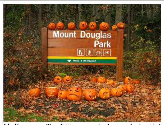
Halloween Tradition – cute but substantial clean-up costs come out of parks budget.

If you enjoy and want a clean park, it's up to you! Saanich Parks does not perform litter pickup along the Park trails. Sadly, doggy bags, cigarettes butts and discarded Kleenex tissues are all too common. No doubt the guilty are not members of FMDPS and don't read these newsletters – so it is up to us to help! Why not take a plastic bag with you and collect a little litter?