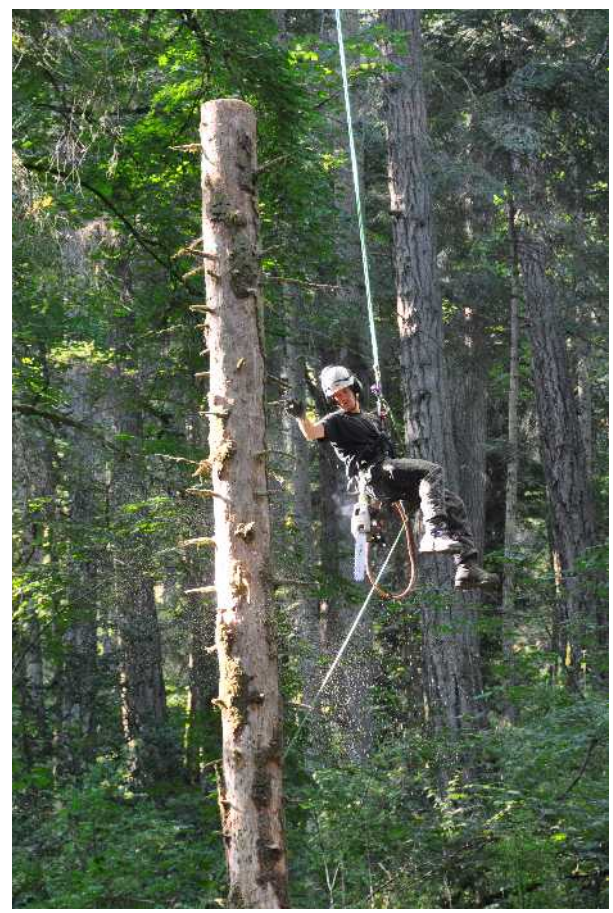
Saanich Parks Arborist rappels down rope after topping a danger tree next to the Whittaker Trail.

It was fascinating observing the expertise of these Saanich arborists as they shot a line over an adjacent healthy tree, climbed the rope, then climbed even further up the tree to finally lower themselves to the dead danger tree (see photo) and proceeded to top it. Working on another tree which they felt too unpredictable to simply cut down, they notched it (see photo) and then attempted to pull it over using a long line. The tree was so rotten, it simply snapped above the notch cut, justifying their concerns about standing near it when it was cut!