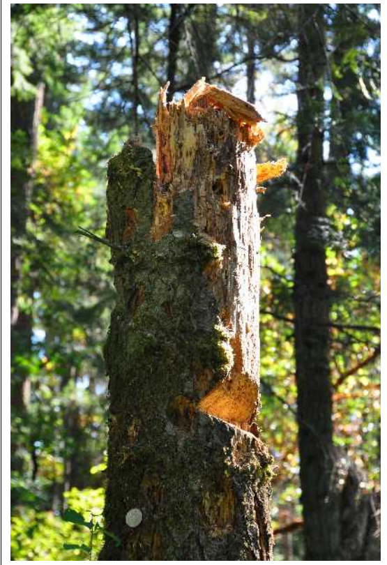
Although this danger tree was notched to create a break point, it chose its own snap point.