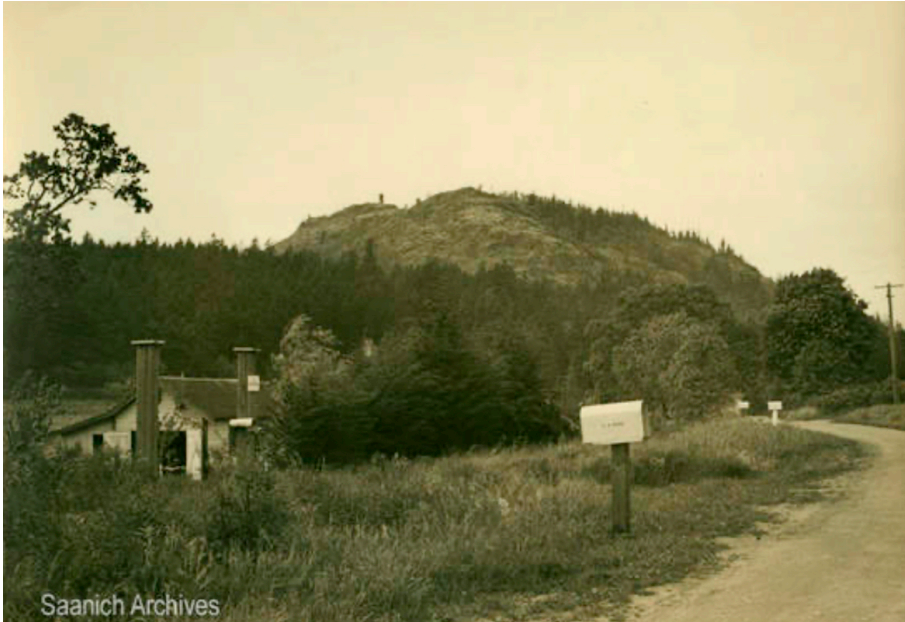
Looking north on Cedar Hill Rd south of Kenmore between 1944 and 1947 (above) and in 2020 (below). A lot of trees have grown up along Cedar Hill Road in the past 70 years.