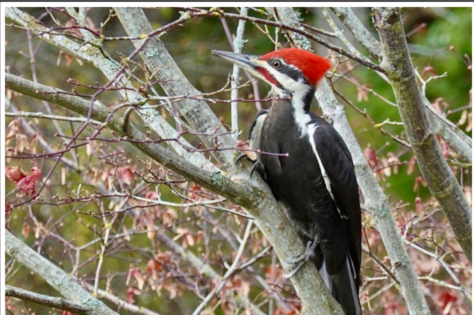
A male pileated woodpecker, Dryocopus pileatus . The male and female of this species look virtually identical but the males have a red patch on their cheeks.

A juvenile bald eagle, Haliaeetus leucocephalus , spotted, at the beach, by Brandon Smith. Bald eagles don't get their adult feathers, with the distinctive white head and tail, until they are around four years old. This one is close to maturity, with golden eyes and lots of white developing among the brown feathers.