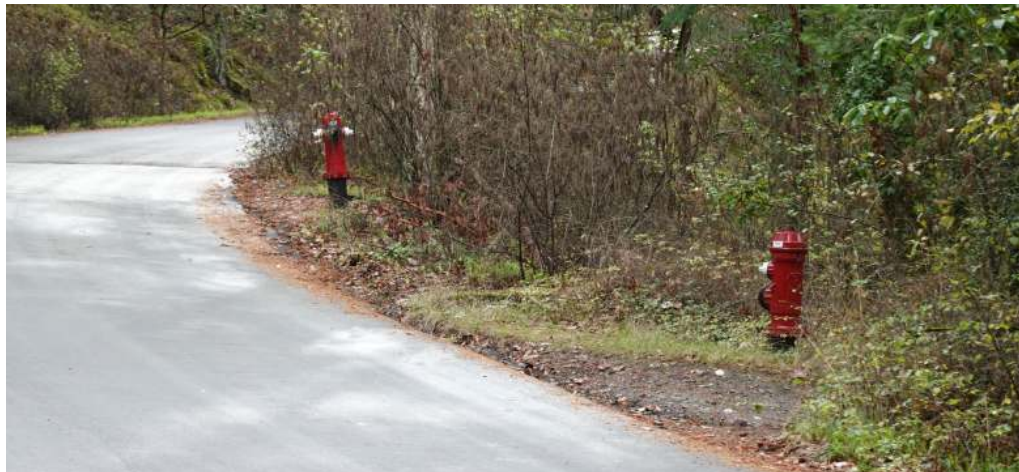
A bit more than halfway up Churchill Dr., you'll see two fire hydrants close together.