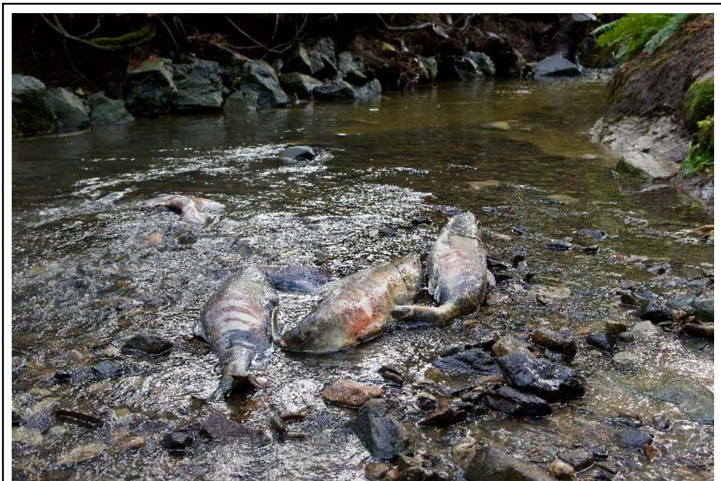
Frozen salmon carcasses in the creek at the new riparian and salmon education centre in Mt Douglas Park.

Salmon fry hatch and remain in fresh water anywhere from a few months to a couple years before heading out to sea. The survival of these young salmon