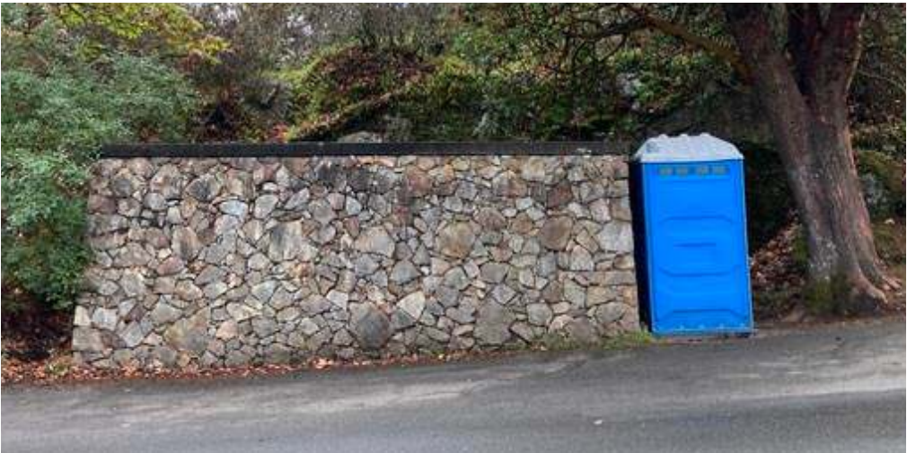
This is the water tank in the parking area at the top of Churchill Dr. The outhouse serves another purpose.