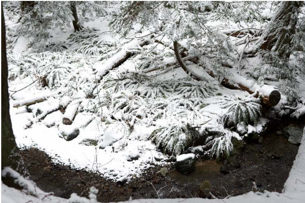
Remember winter? There were a couple of significant snowfalls. Here, snow has almost buried ferns along the shore of the creek.

As part of this event, the teachers did some vegetation restoration work and planted 30 cedars along the Bridge trail between the bridge and Douglas Trail.