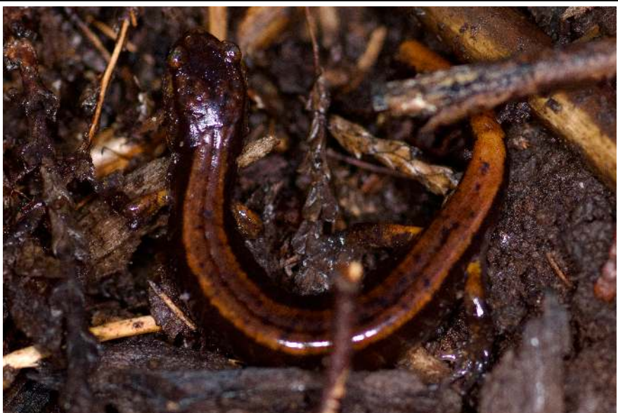
Red-backed salamander near the creek.