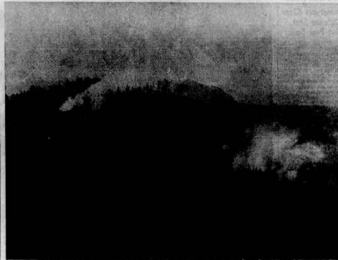
SMOKES OVER MOUNT DOUGLAS are grey and hazy with smoke today and may be that way for some time. Saanich firemen say brush fire that started Tuesday afternoon could take a week to extinguish with fresh winds and dry weather. Worst aspect of blaze will be aftermath, when hikers, horsemen and motorists