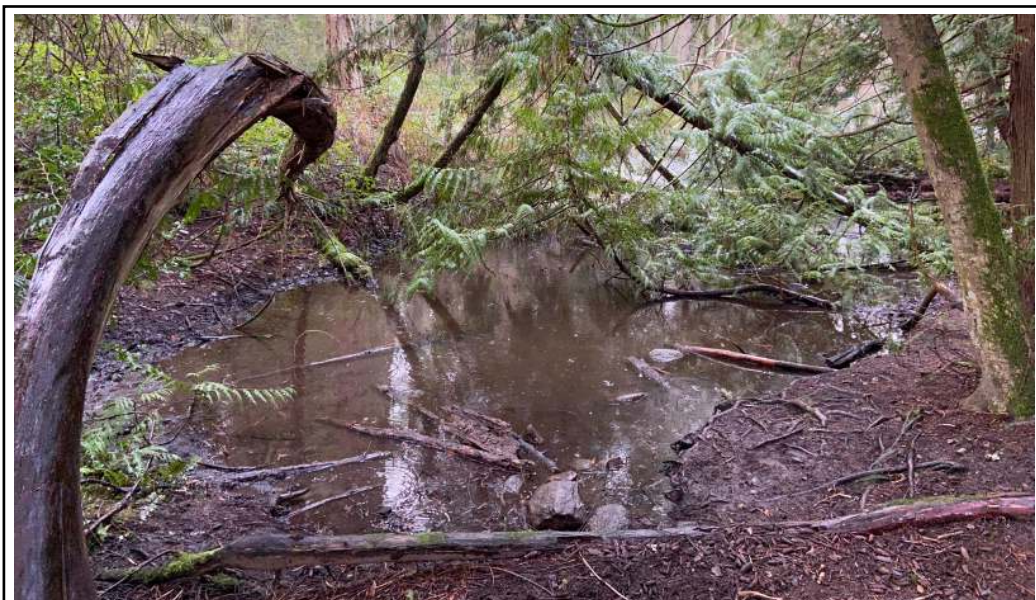
The small pond on Norn trail is important habitat. It'll be dried up by the end of summer.

Ephemeral ponds provide a source of water for wildlife. They are seasonal breeding grounds used by many amphibians, reptiles, and insects. Some creatures rely on ephemeral ponds exclusively to breed and will migrate to the same pond each spring to lay eggs. In the Park a few species that can be found in ephemeral ponds are the northwestern salamander, red-backed and long-toed salamanders (see below for photos), rough skinned newt, pacific tree frog, and the northern red legged frog.