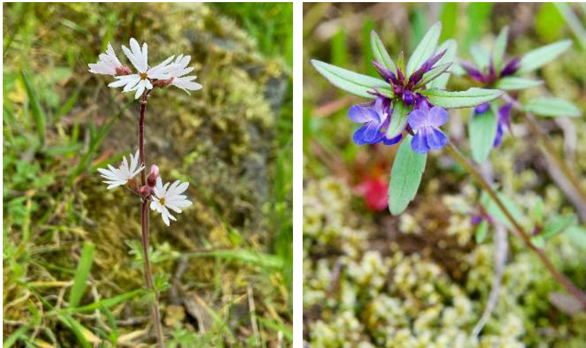
Tiny wildflowers in the park: Woodland stars (left) and Blue-eyed Mary.