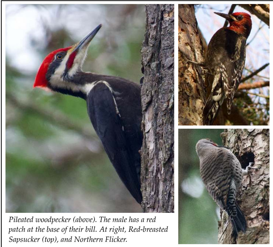
Pileated woodpecker (above). The male has a red patch at the base of their bill. At right, Red-breasted Sapsucker (top), and Northern Flicker.