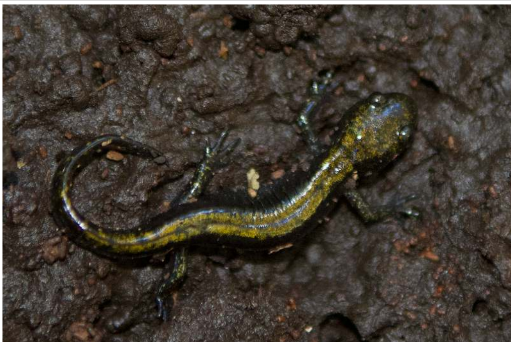
Long-toed salamander at the Norn pond.

In the spring, breeding frogs and salamanders deposit jelly-like masses of eggs in ephemeral ponds. As thousands of these amphibians hatch they feed on a variety of insects that are hatching at the same time, such as dragonflies and mosquitos. Young amphibians will remain in the ephemeral ponds until fully developed before making their way into the forest to continue their adult life.