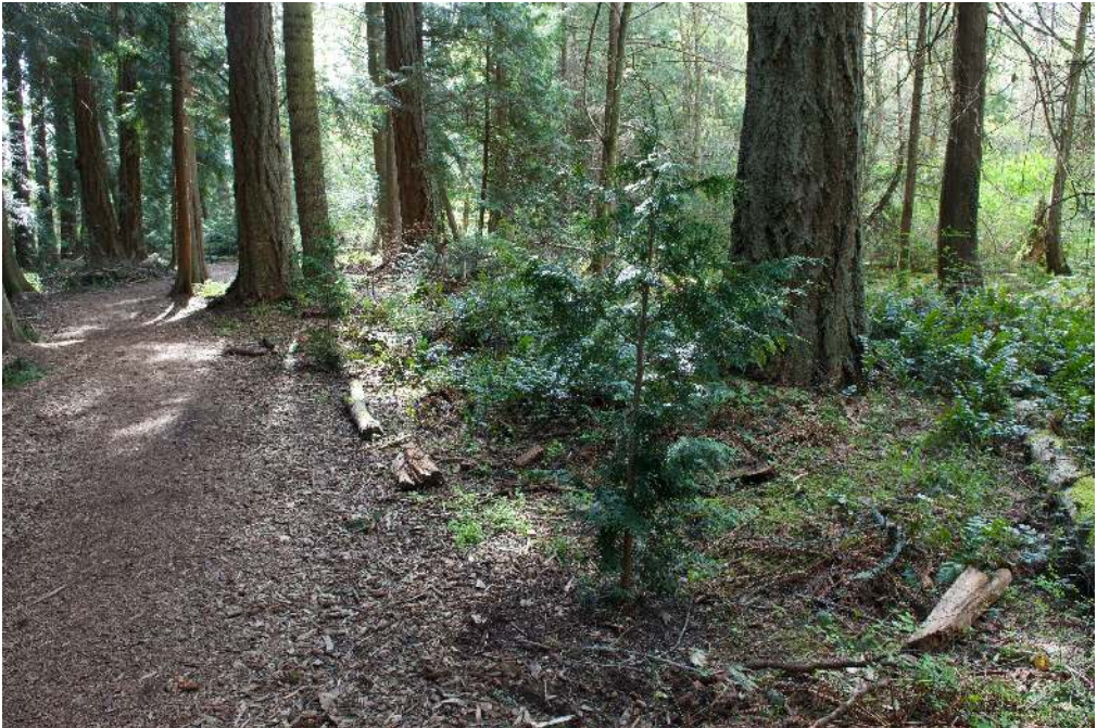
New cedars, planted along the Bridge trail this past winter.