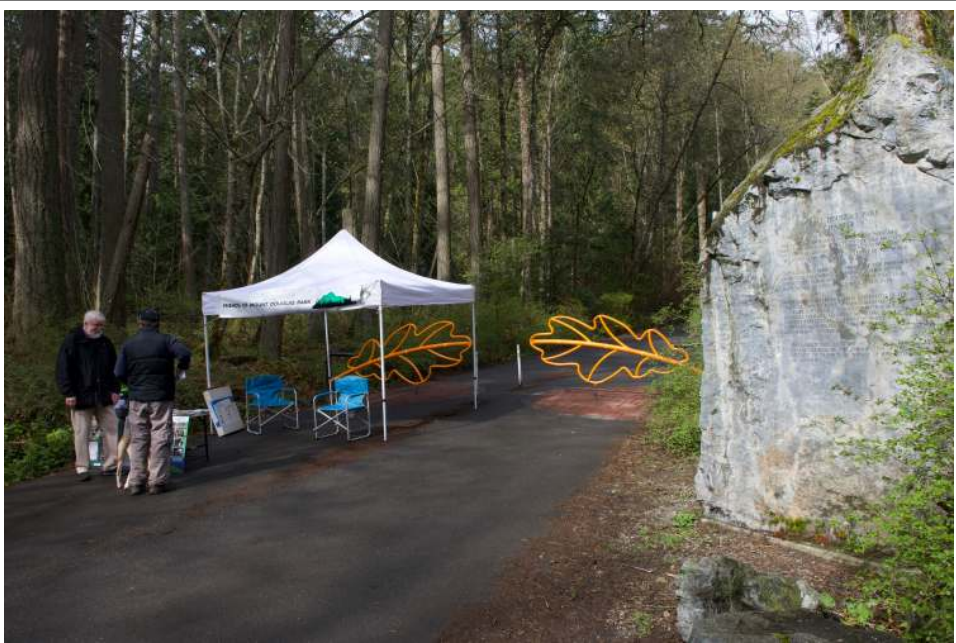
At least once each month we try to set up our information tent in the park. We are always looking for new members or volunteers.