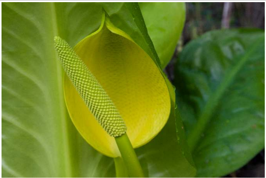
Skunk cabbage flowering in a marshy patch on Irvine trail.