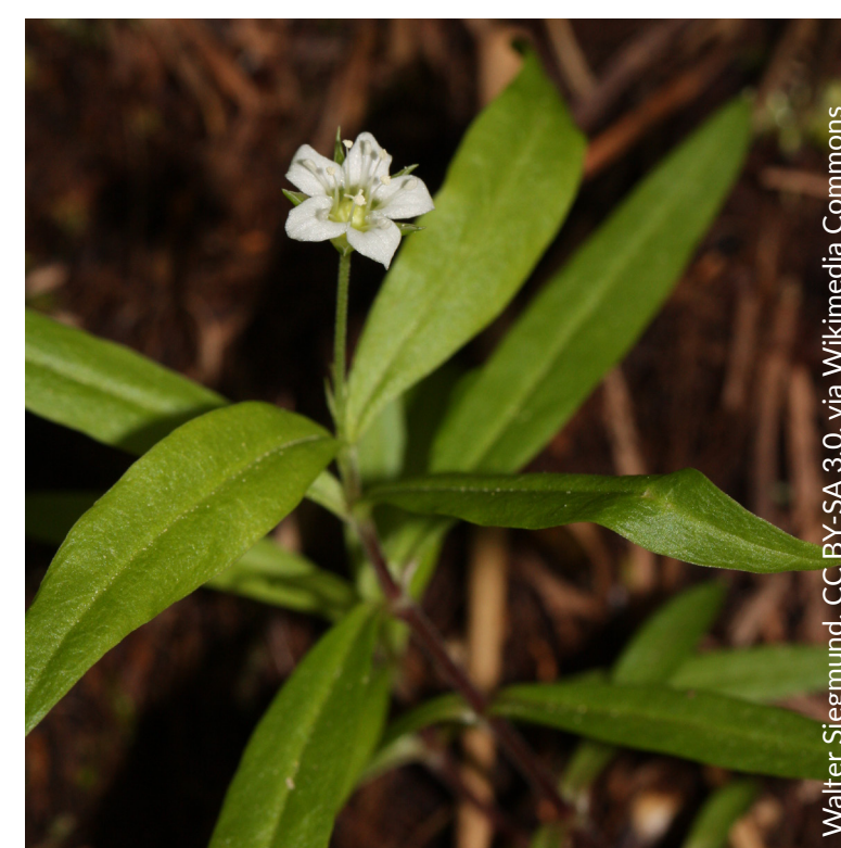
Big-leaved sandwort Moehringia macrophylla