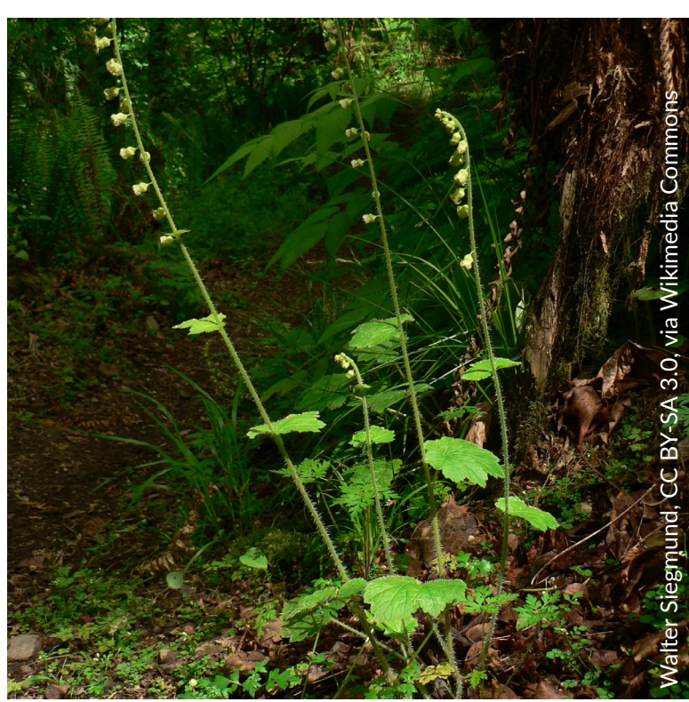
Fringecup Tellima grandiflora

By staying on marked trails and keeping pets under control at all times, we can avoid putting any additional stress on our native species and improve their chances of thriving and surviving for future generations to enjoy.