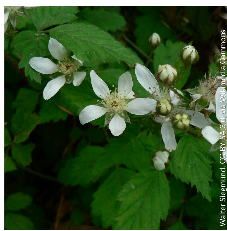
Trailing blackberry Rubus ursinus