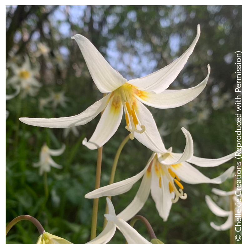
Giant white fawnlily Erythronium oregonum