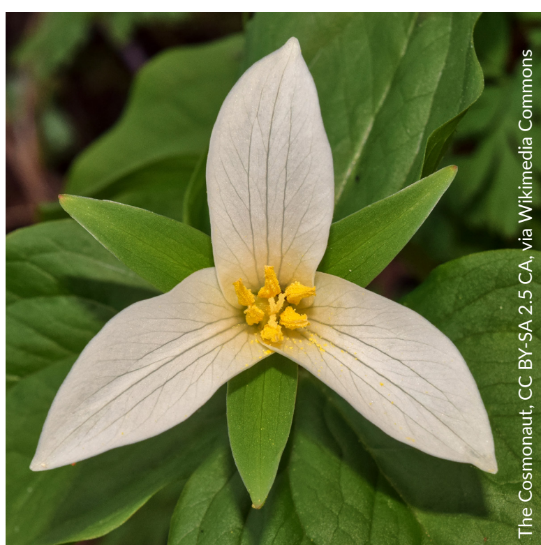
Western trillium Trillium ovatum