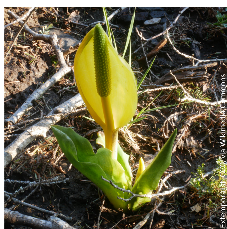
Skunk cabbage Lysichiton americanus