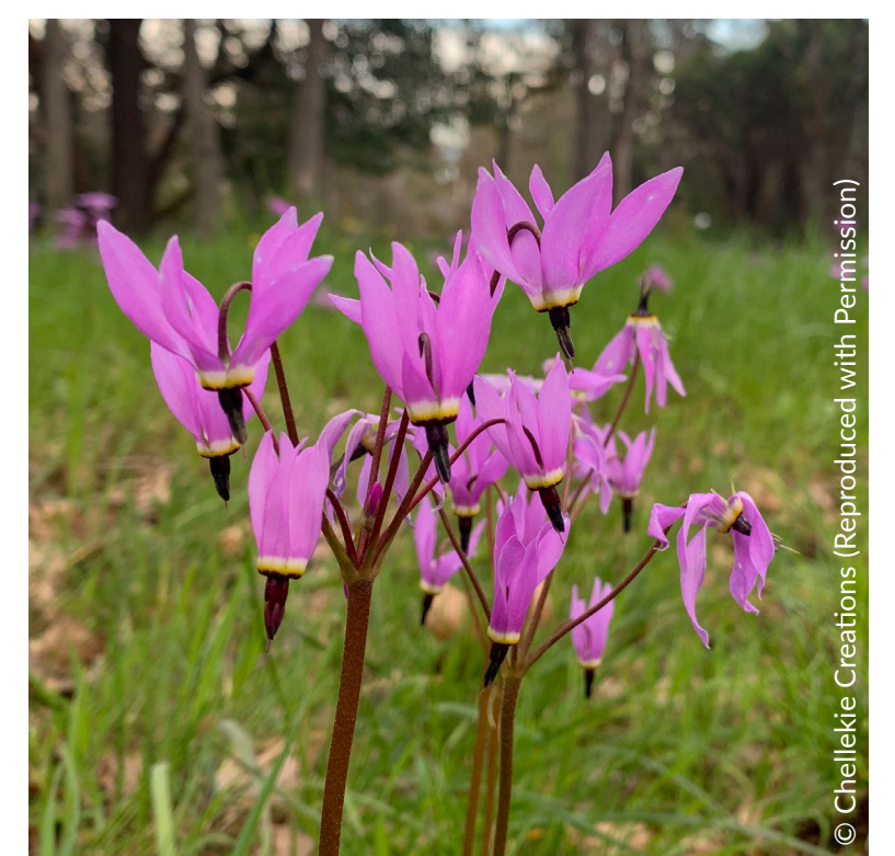
Henderson's shooting star Primula hendersonii