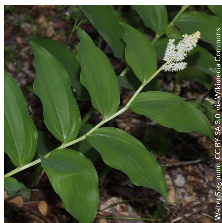
False solomon's-seal Maianthemum racemosum