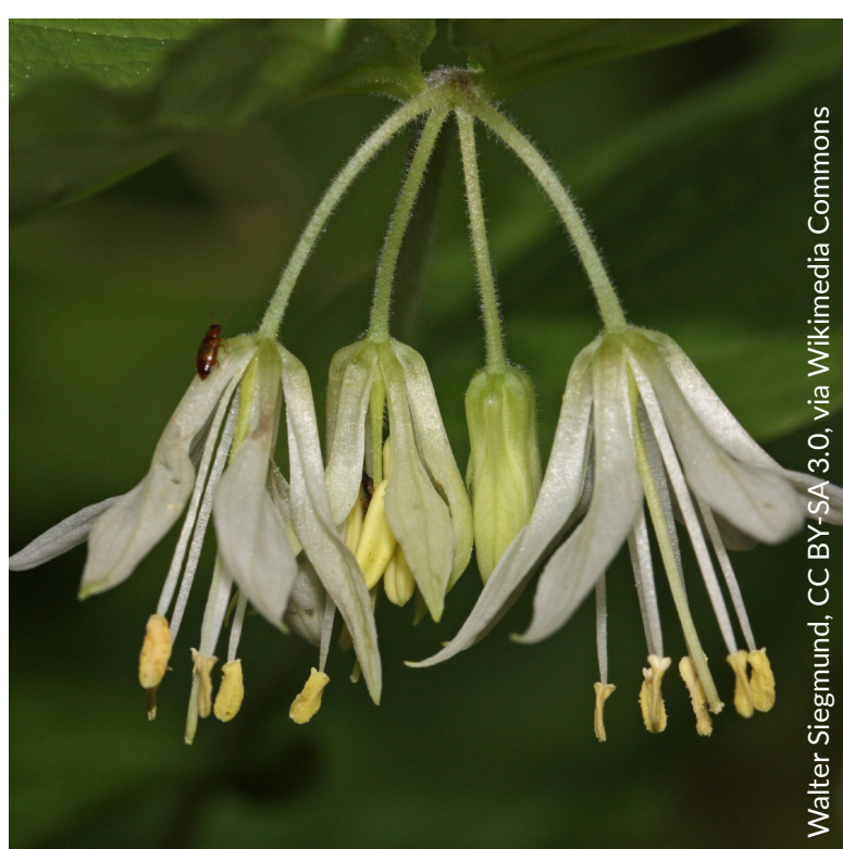
Hooker's fairy bells Prosartes hookeri