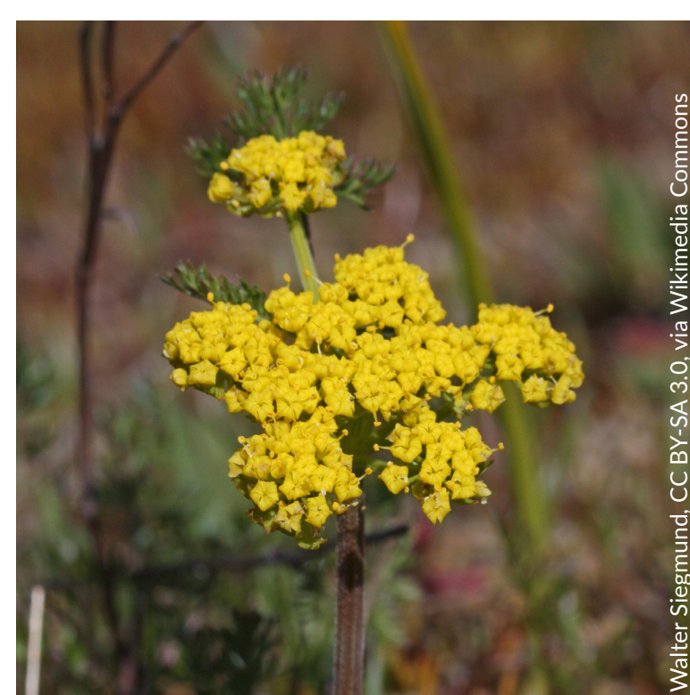
Spring gold Lomatium utriculatum