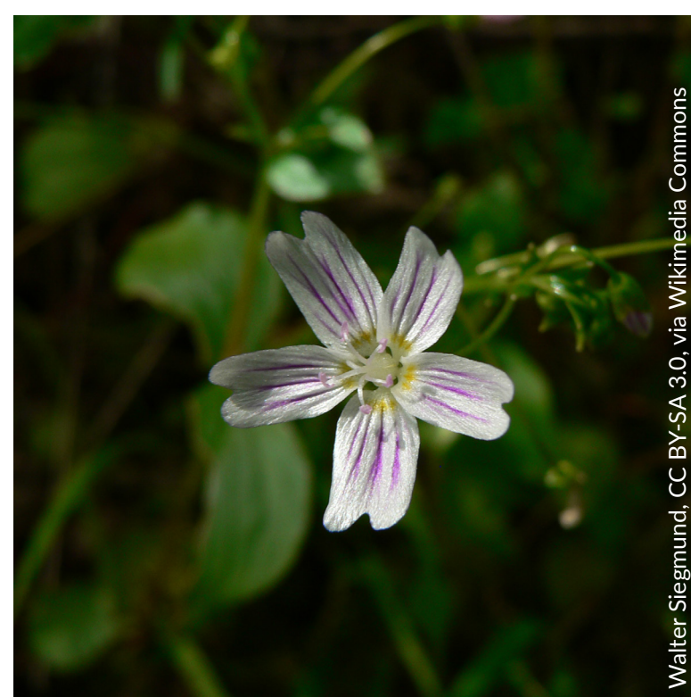
Siberian miner's lettuce Claytonia sibirica