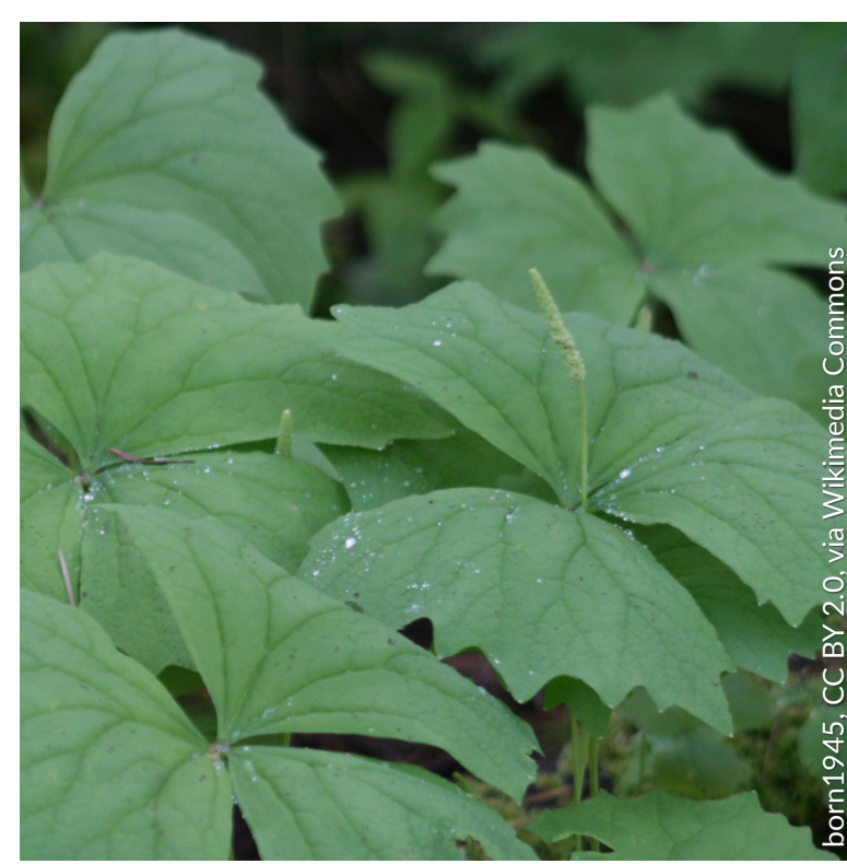
Vanilla leaf Achlys triphylla