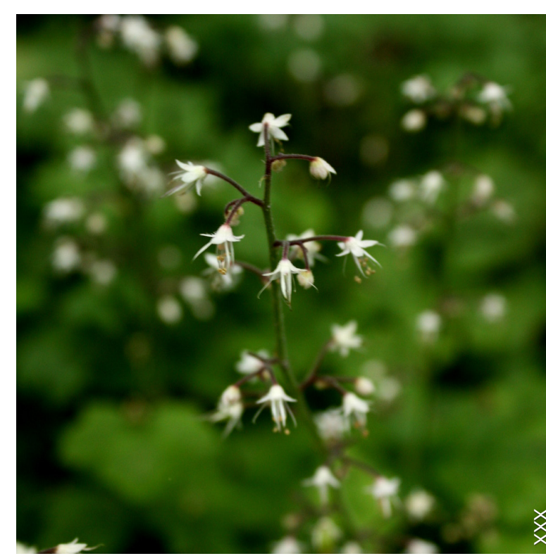
Foamflower Tiarella trifoliata