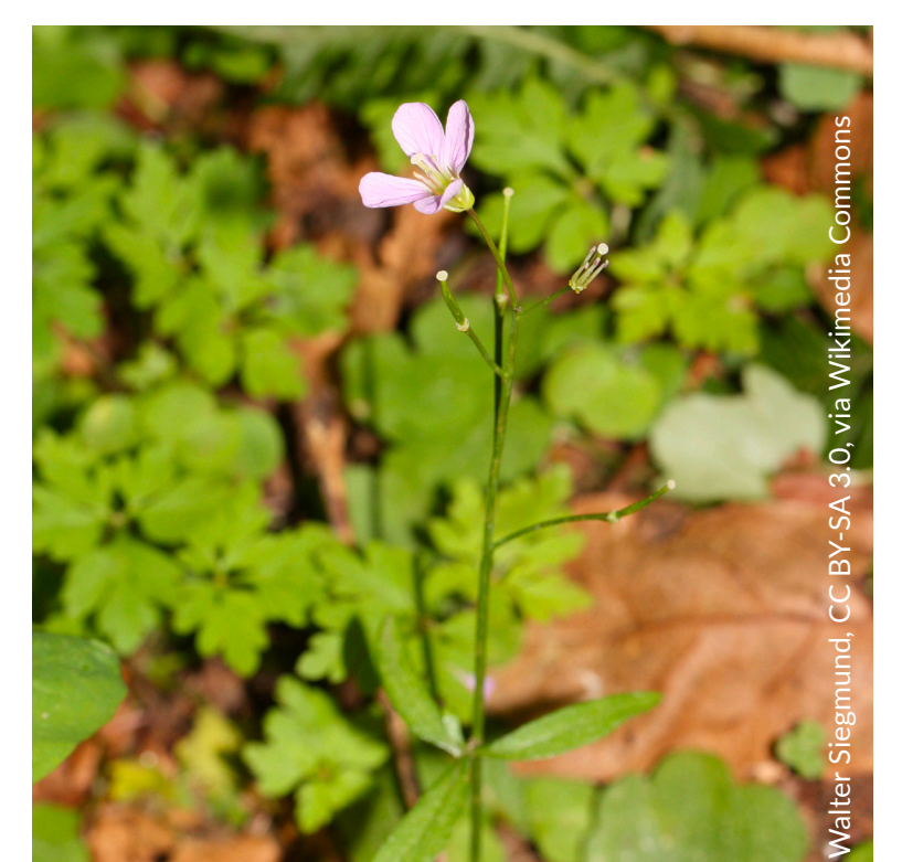
Nuttall's toothwort Cardamine nuttallii