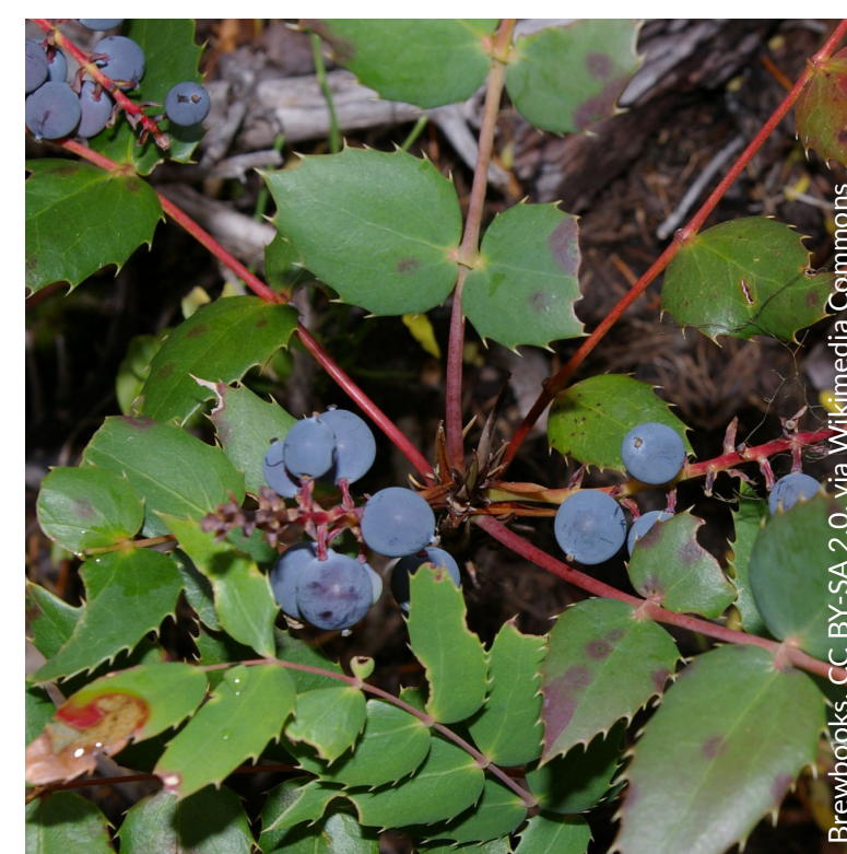
Dull Oregon-grape Mahonia nervosa