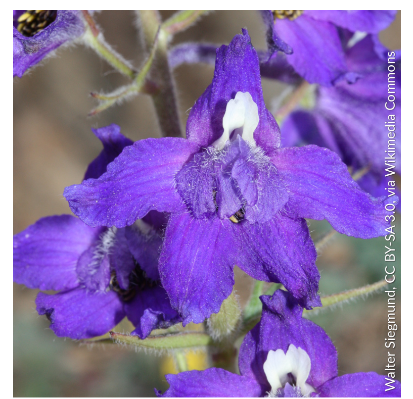
Menzies Larkspur Delphinium menziesii