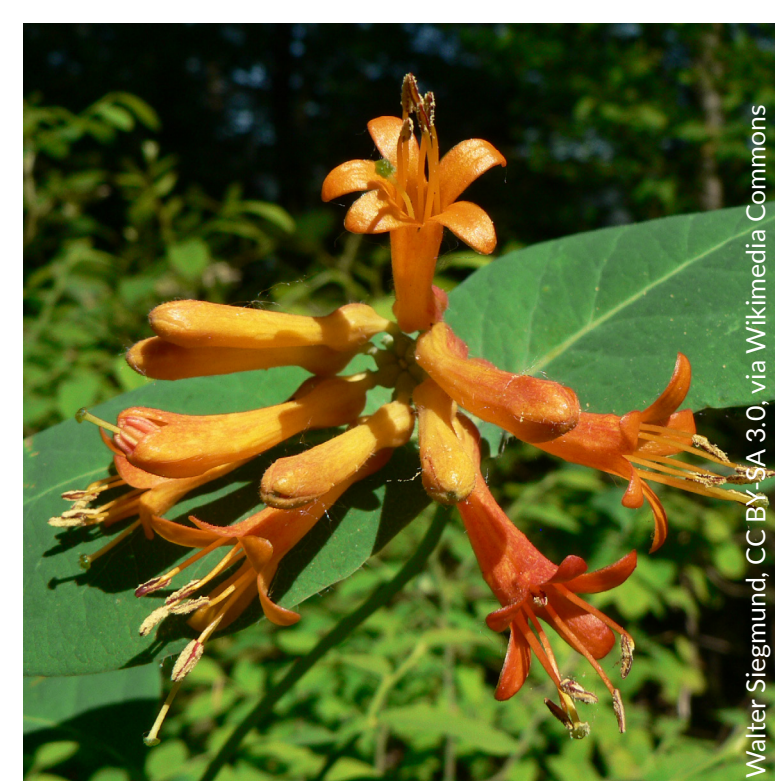
Western trumpet honeysuckle Lonicera ciliosa