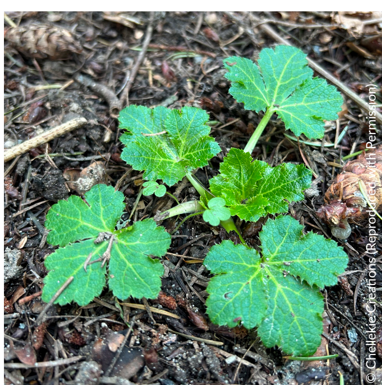
Pacific sanicle Sanicula crassicaulis